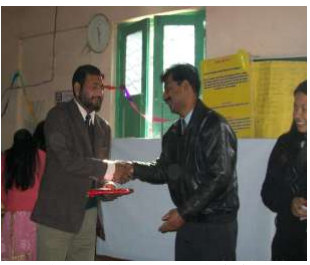
Sri Ram Colony Govt school principal.