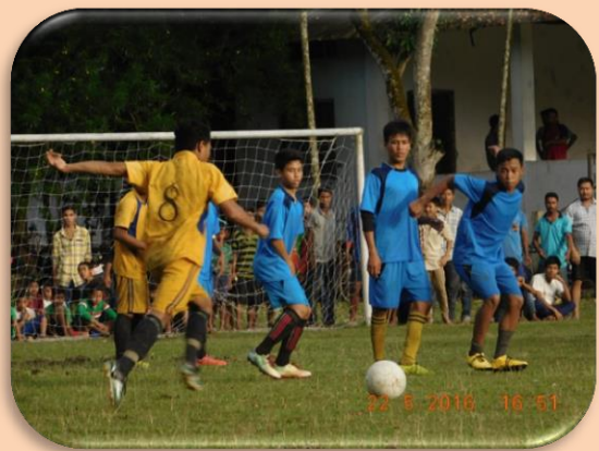
Figure 8: U - 14 EPS – Majuli Football League