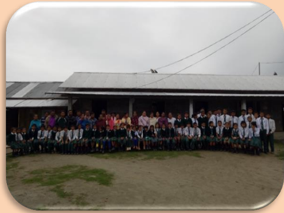
Figure 11: EPS Sponsor Students with Parent