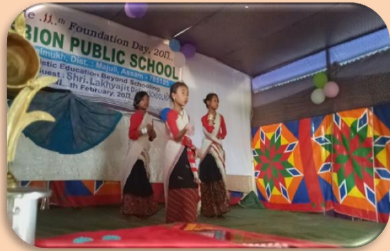
Figure 9: EPS Foundation Day Celebration