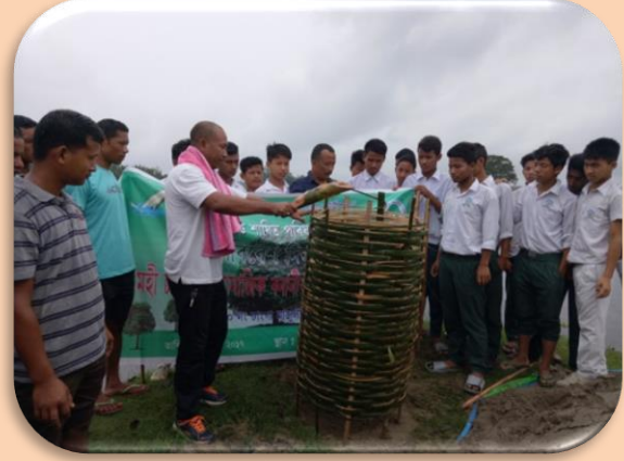
Figure 6: Observation of World Environment Day