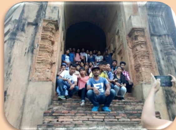
Figure 5: Class IX & X Education Tour to Sivasagar