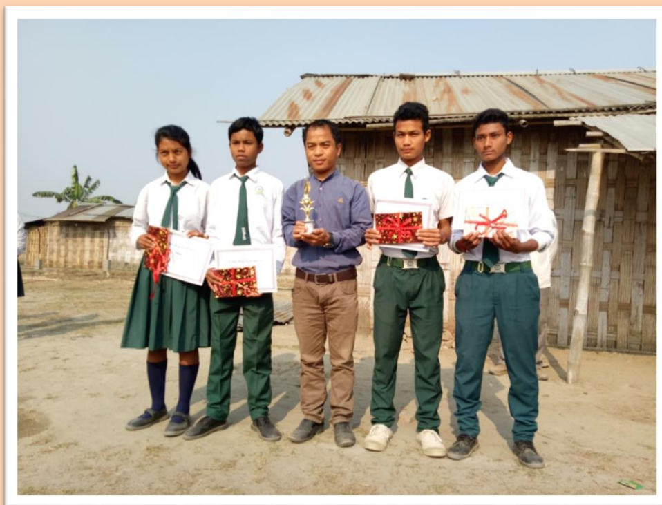
Figure 1: Students with Principal holding their Prize won in Inter School Quiz Competition