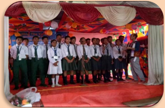
Figure 7: Students Performing during Teachers' Day