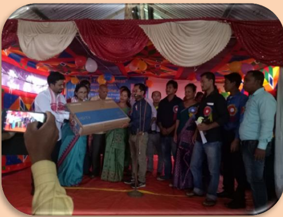
Figure 10: Presentation by Kindling the Kindness