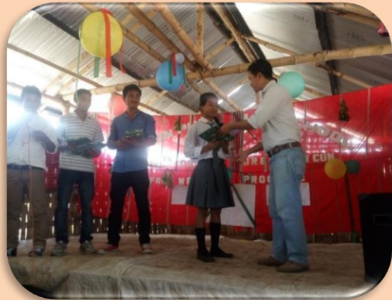
Figure 4: Children's Day Celebration