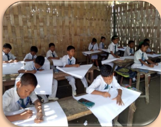
Figure 3: Drawing Competition