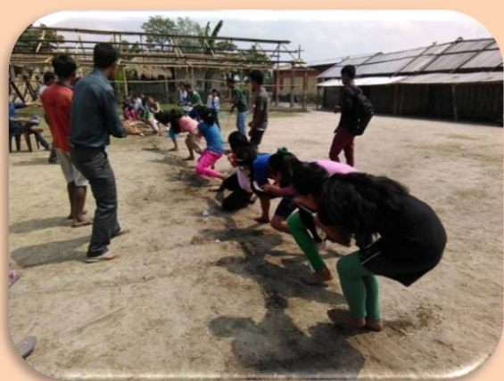
Figure 2: Annual School Sport Meet